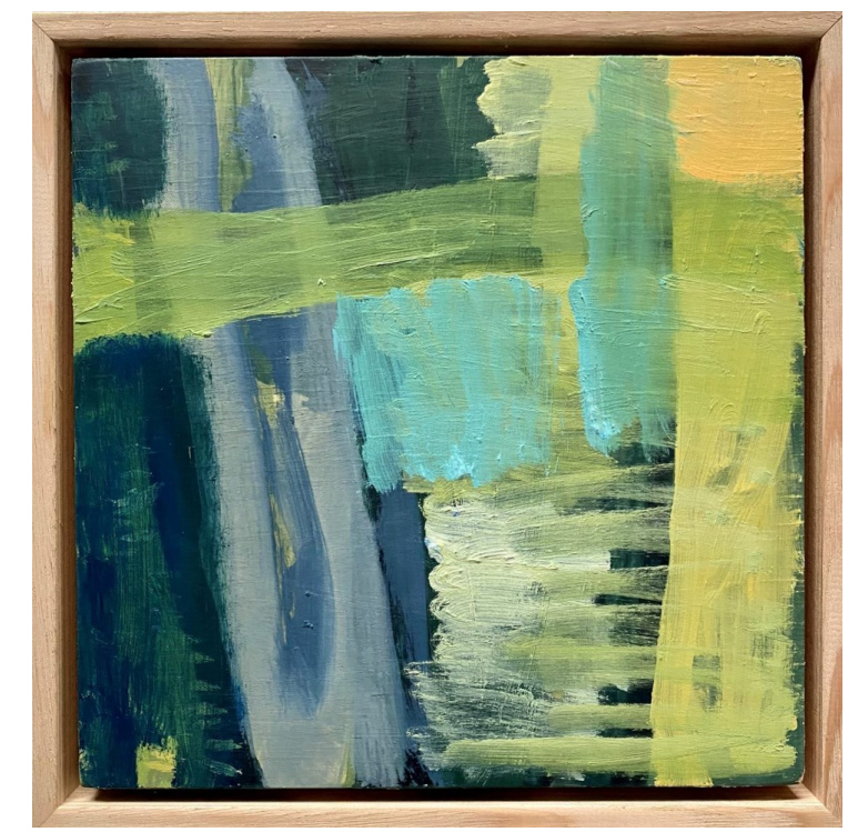
Stretching Towards the Sun