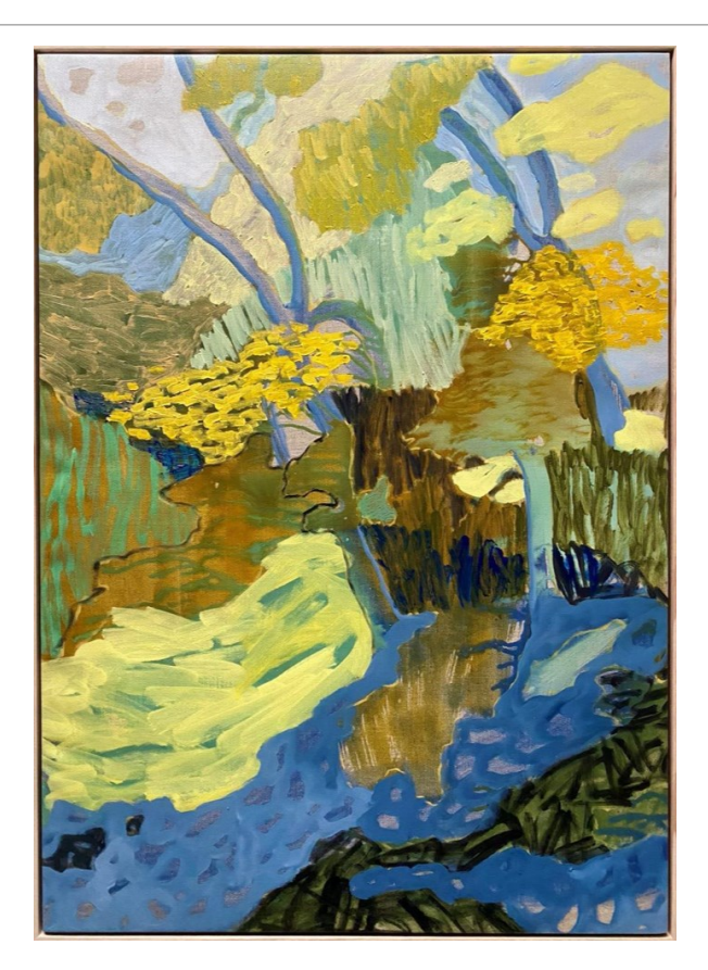
Dances with Daffodils