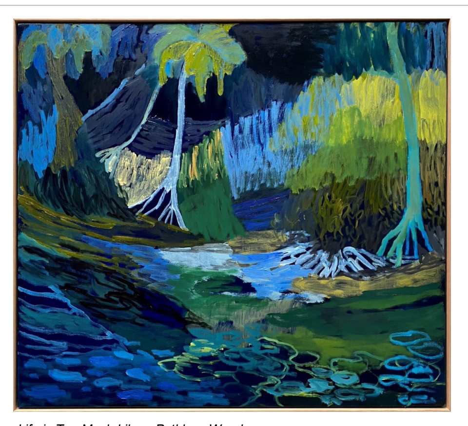
Life is Too Much Like a Pathless Wood