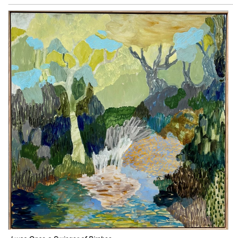
I was Once a Swinger of Birches