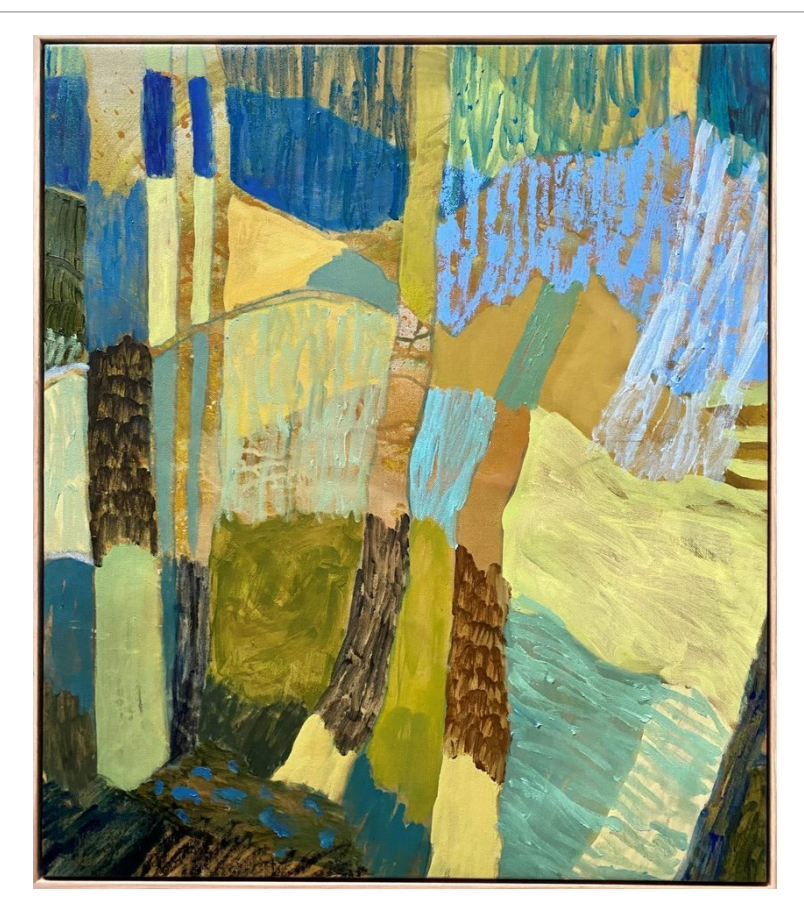
You May See Their Trunks Arching in the Woods