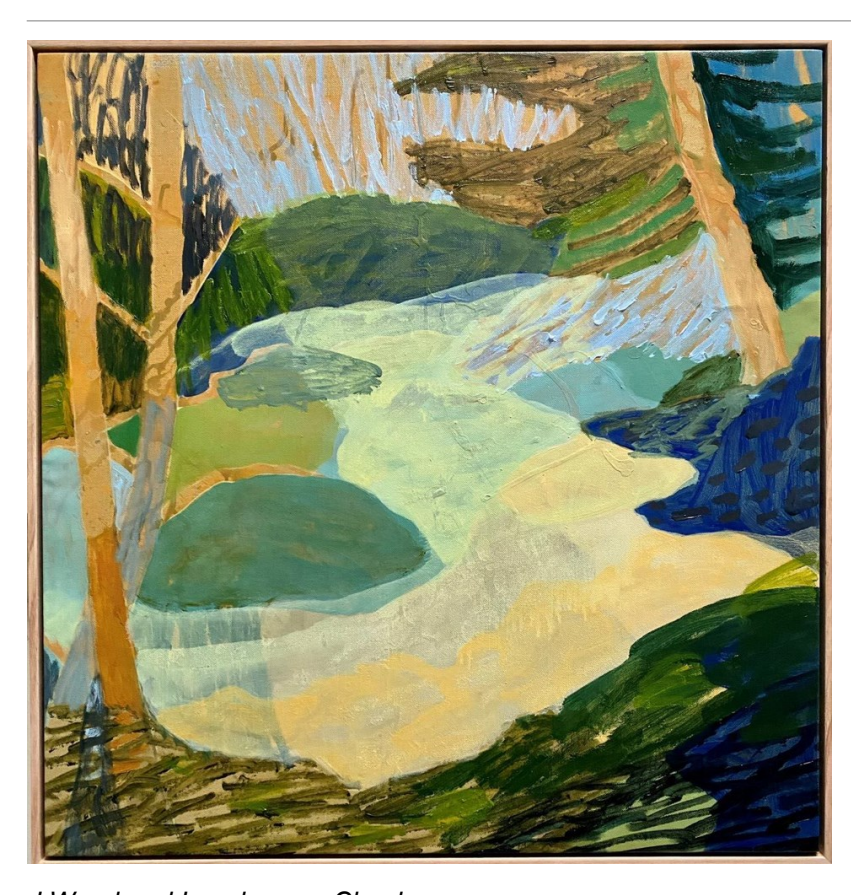
I Wandered Lonely as a Cloud