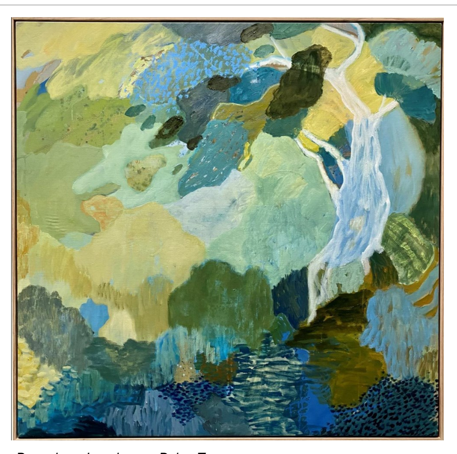
Dawn is as Lonely as a Dying Tree