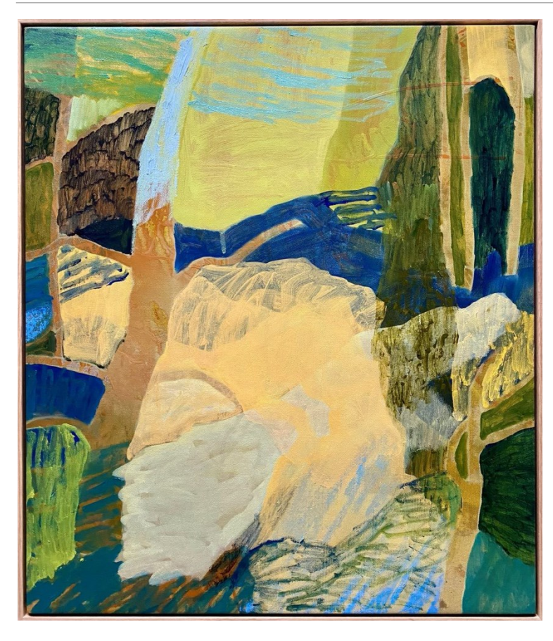
I'd Like to get Away from Earth for a While