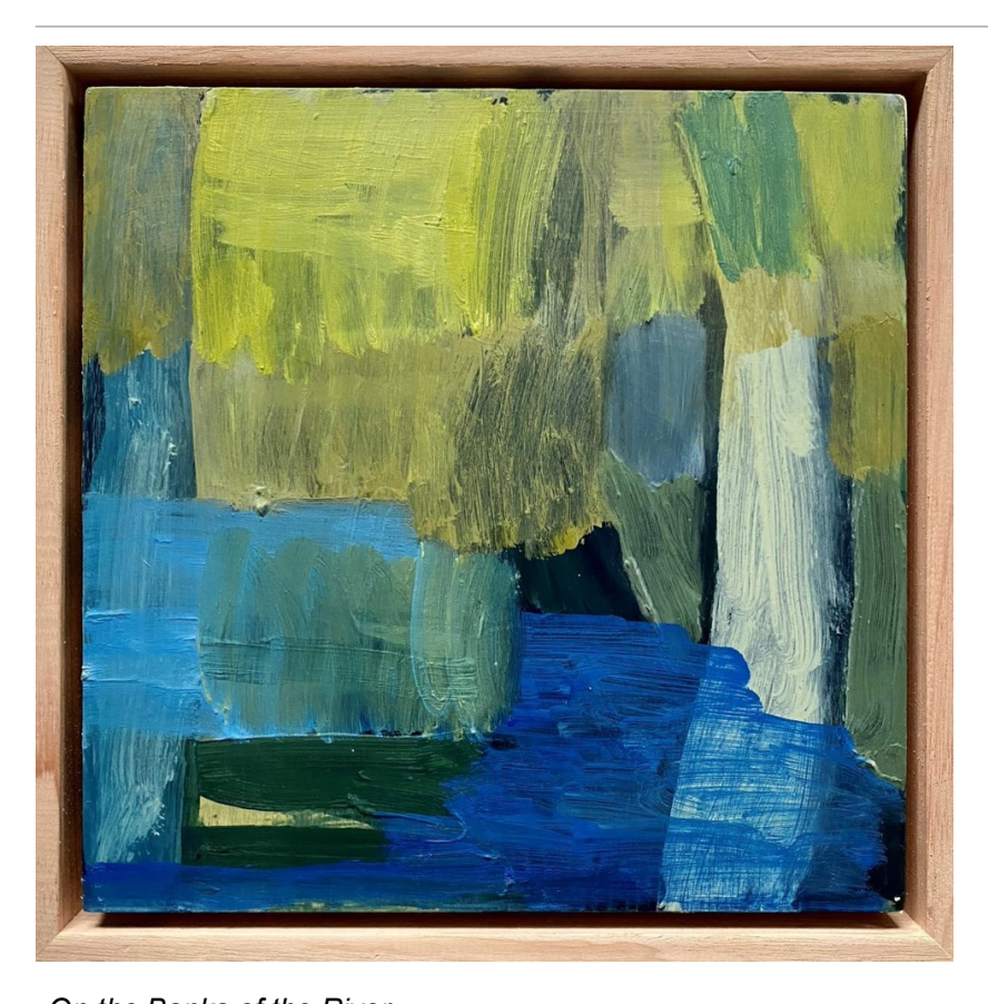
On the Banks of the River