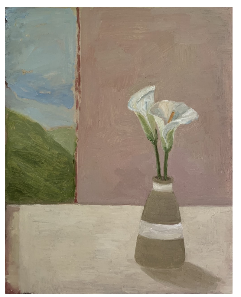
Arum Lilles / Being Laid Out Like A Mist