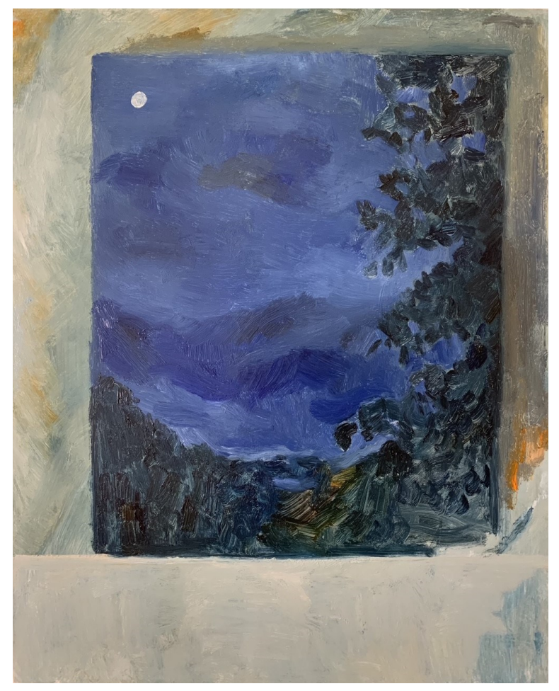
The Hour, Irrevocable