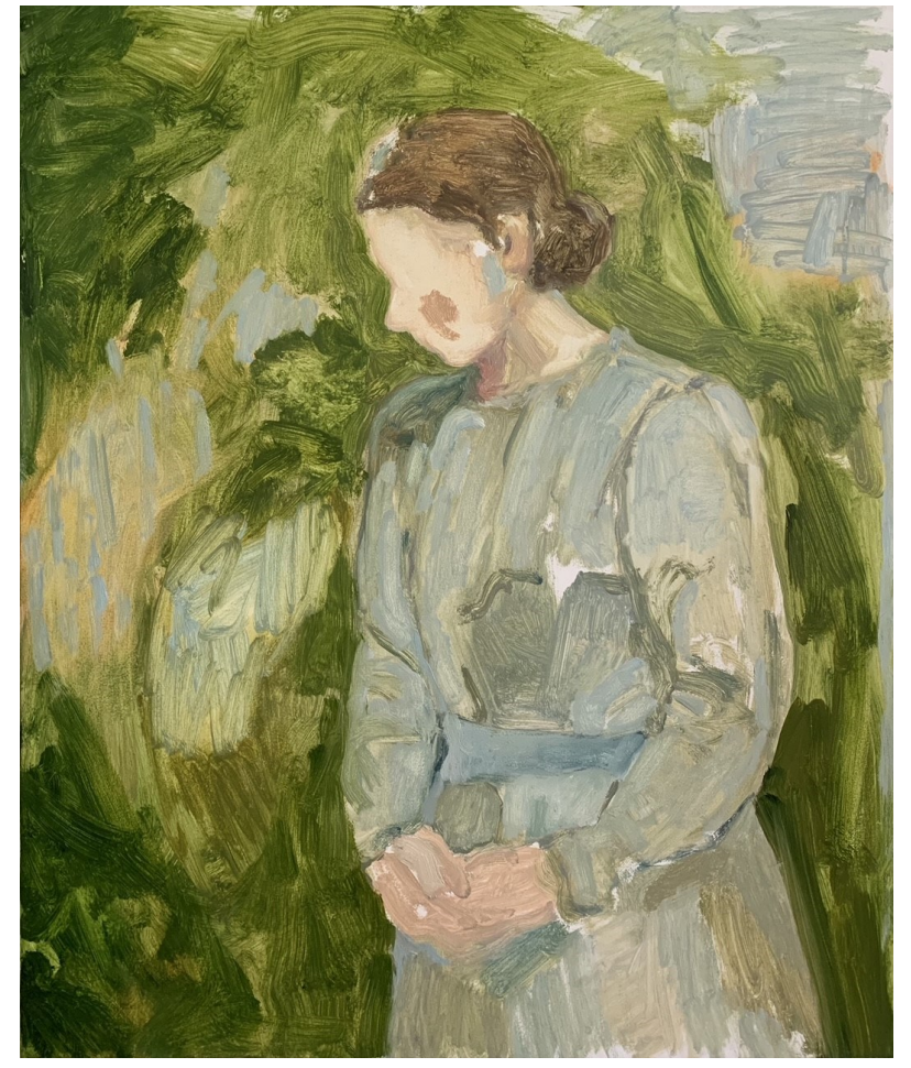
She Sliced Like A Knife Through Everything