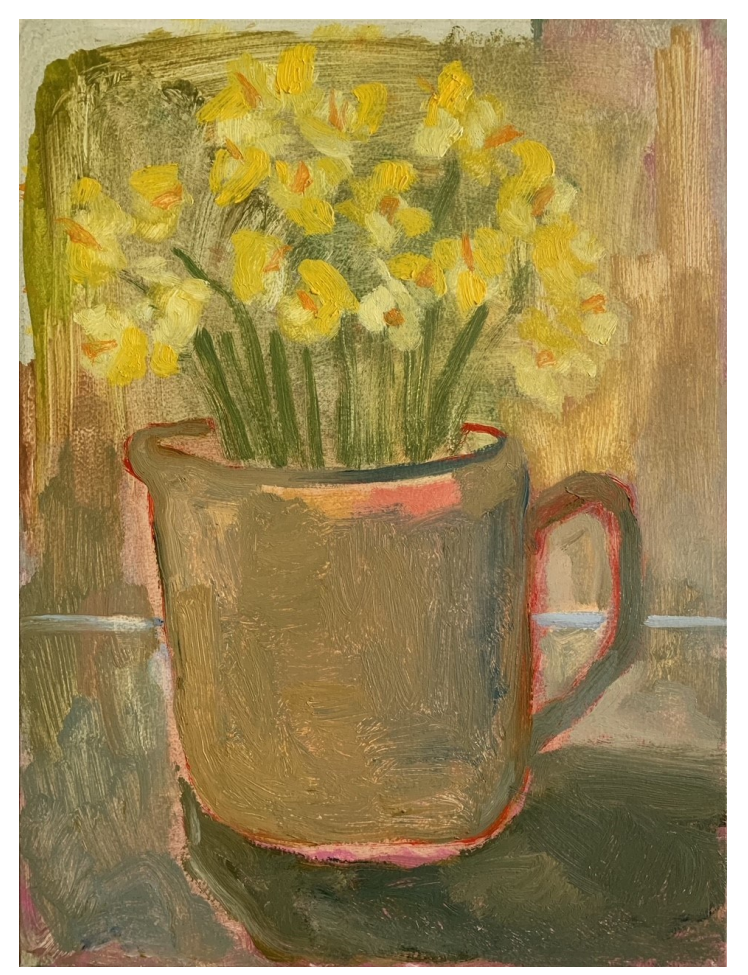
Every Flower Seems to Burn by Itself, Softly