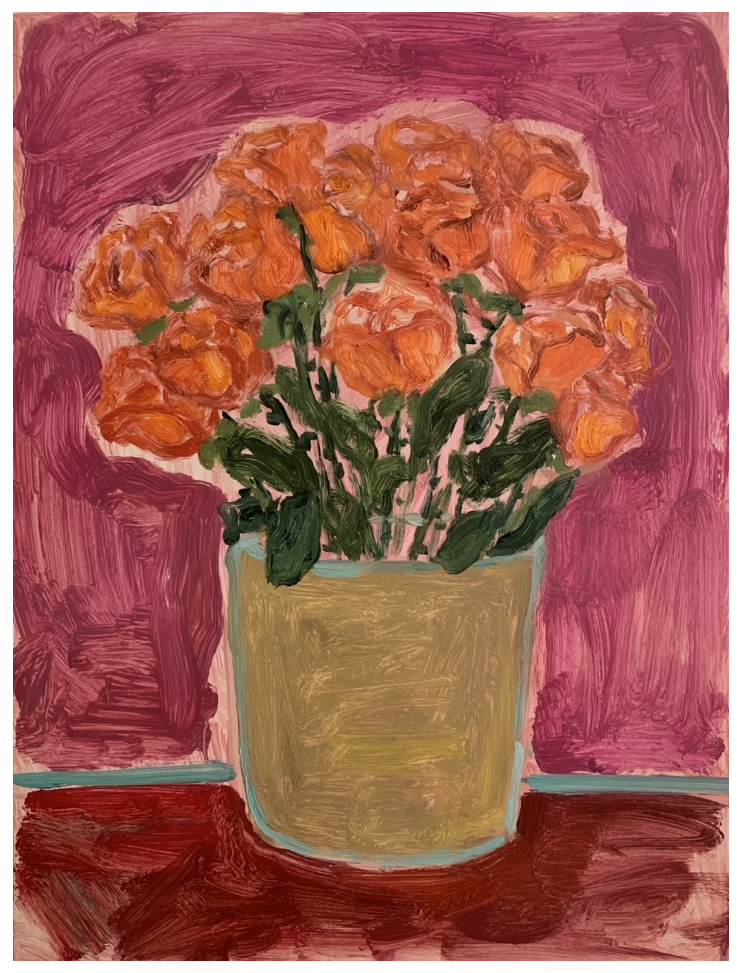
There Were Roses