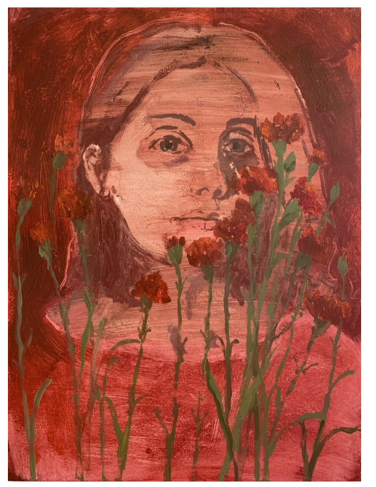
Dark and Prim the Red Carnations