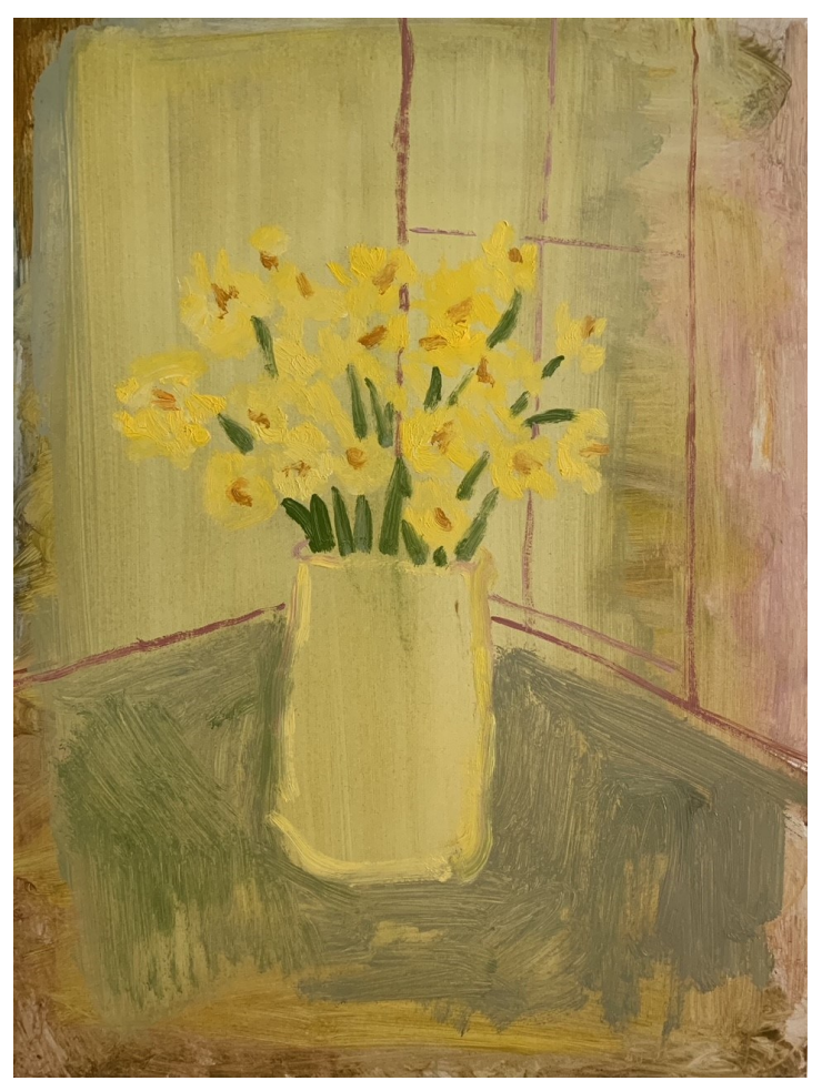
It Was the Moment Between Six and Seven