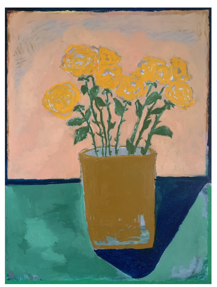
After the Superb Summers Day / It Was June