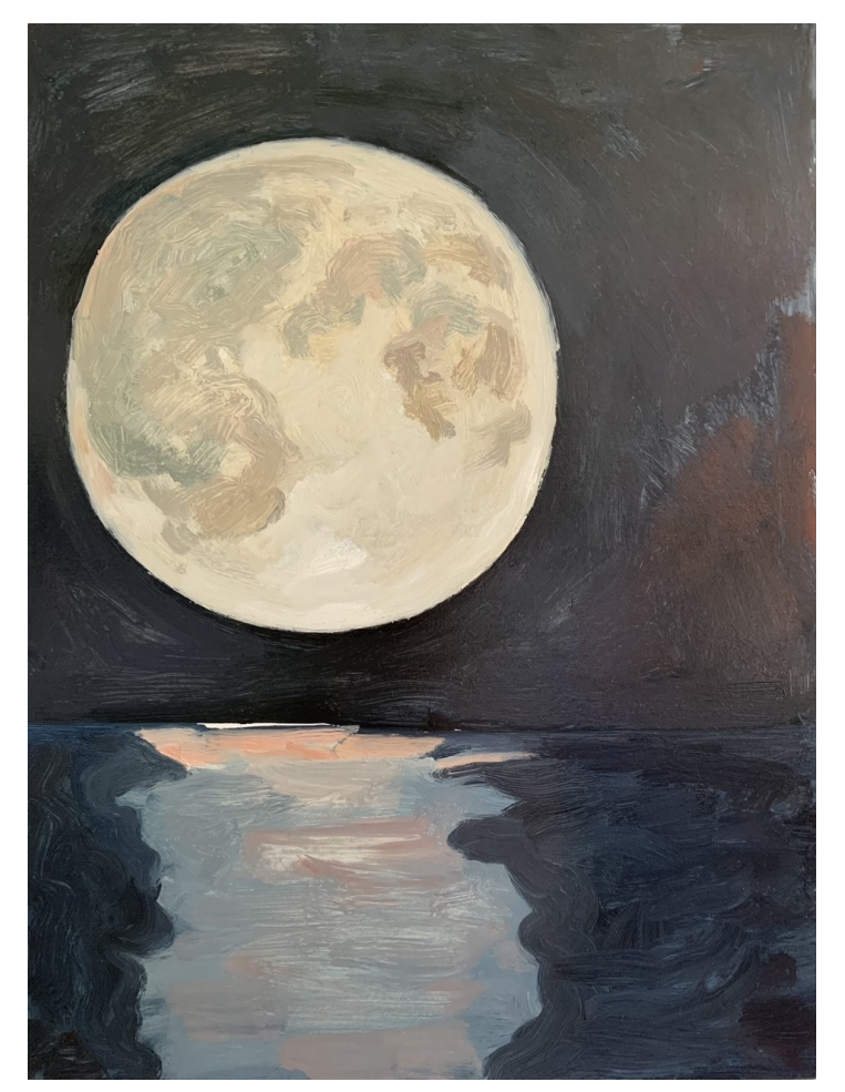
An Absurd and Faithful Passion