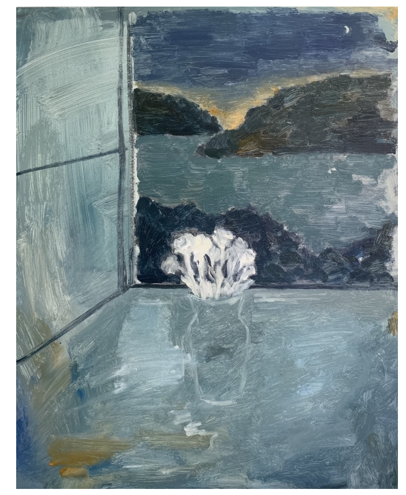
In Being Well, In Being Loved