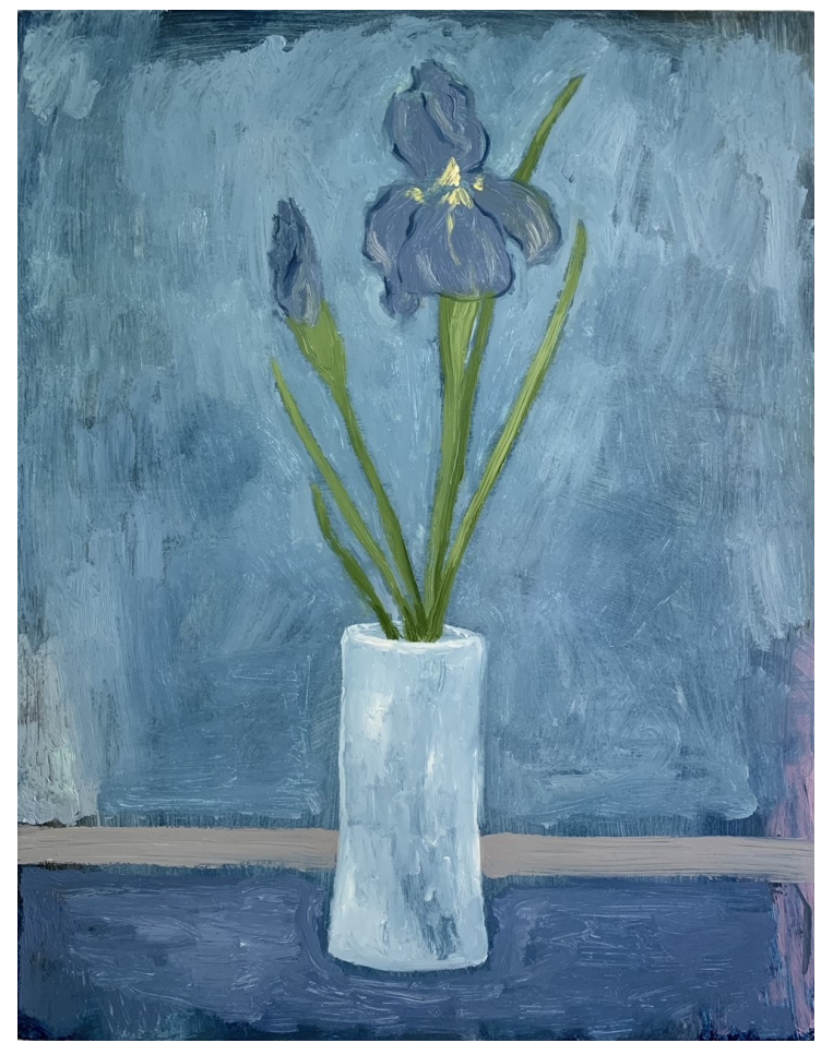
There Were Irises