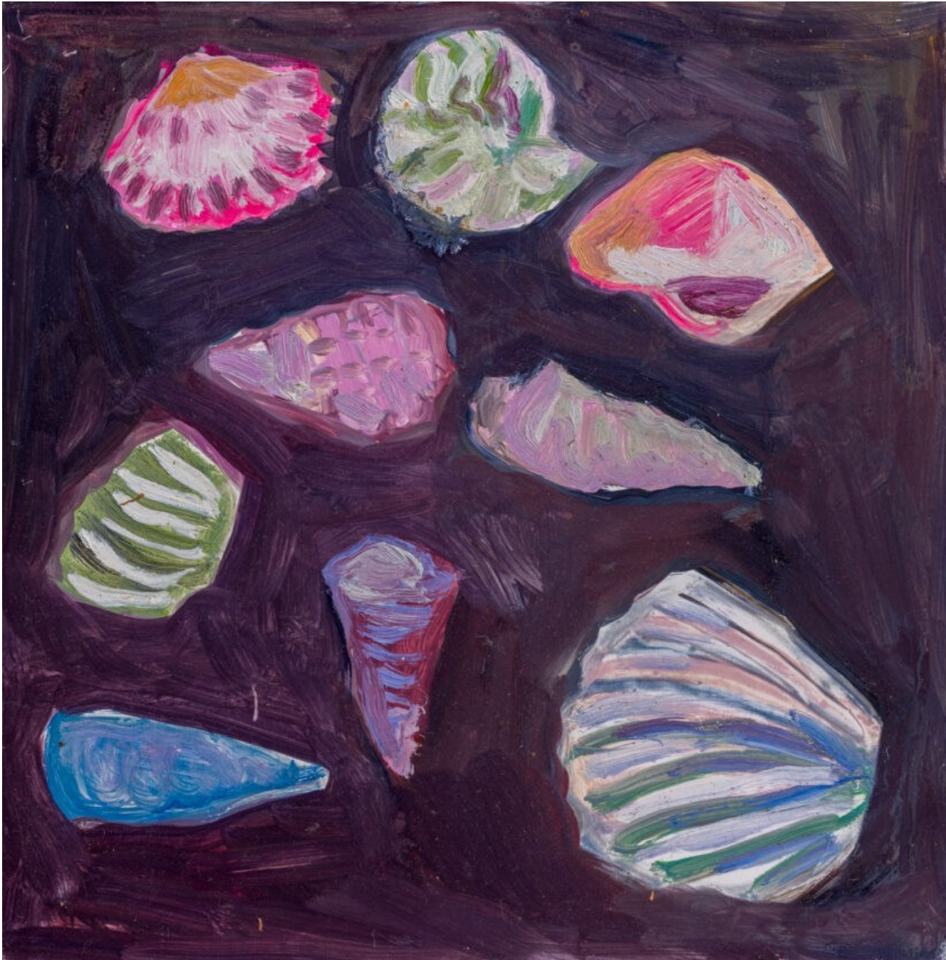
Collection of Shells