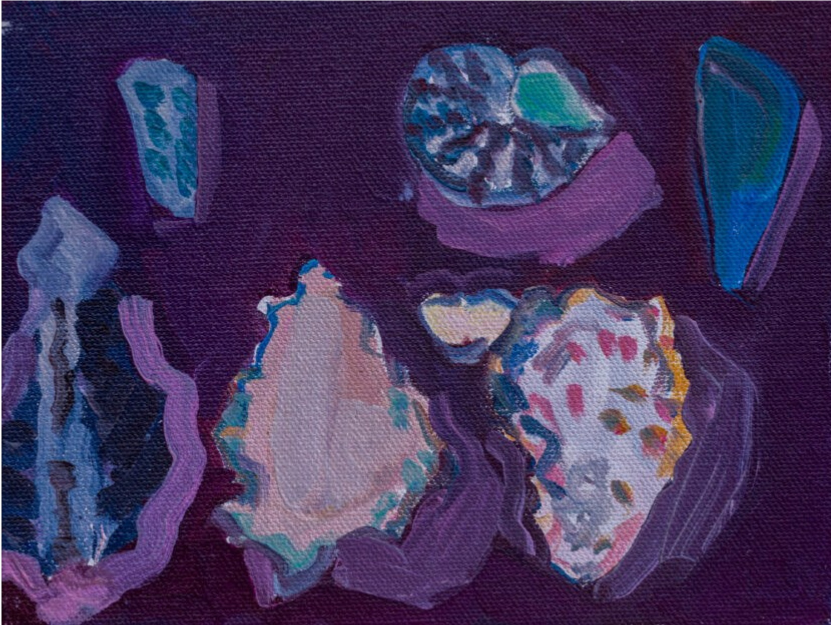
Shells on Dark Background