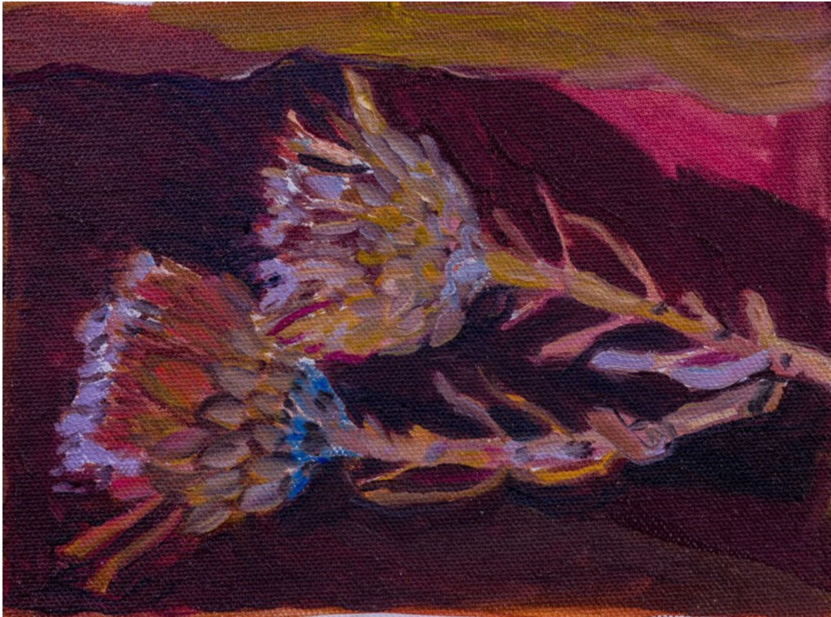
Dried Protes at Spring Beach I