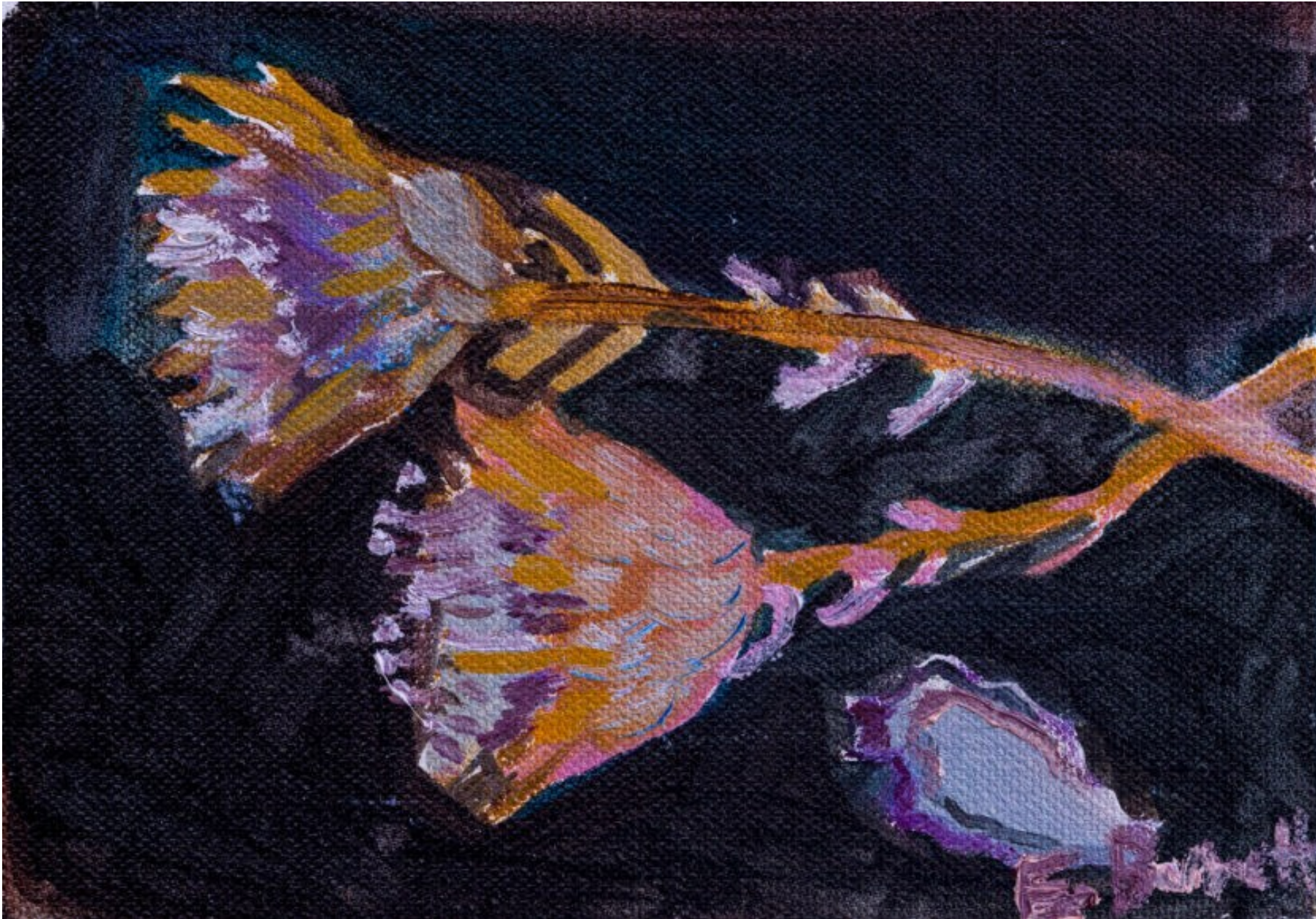
Dried Protes at Spring Beach