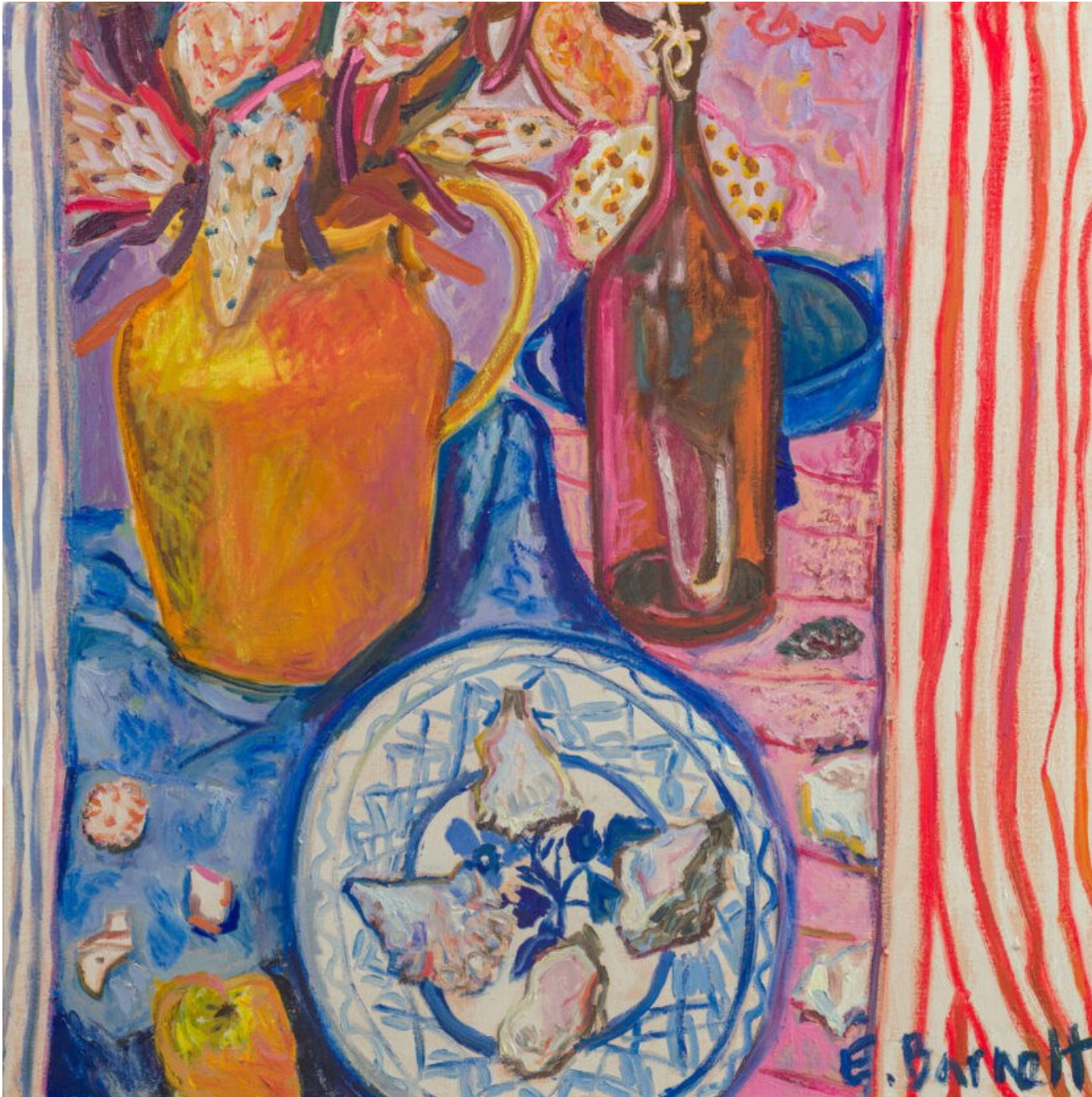
Oysters and Kombucha