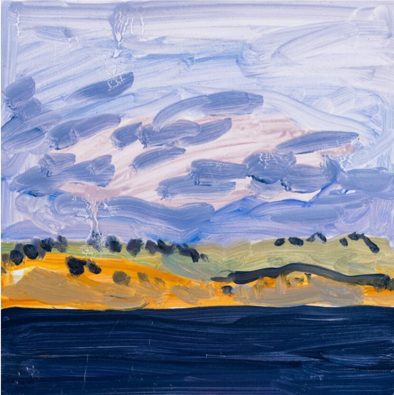
Looking Out From Spring Beach