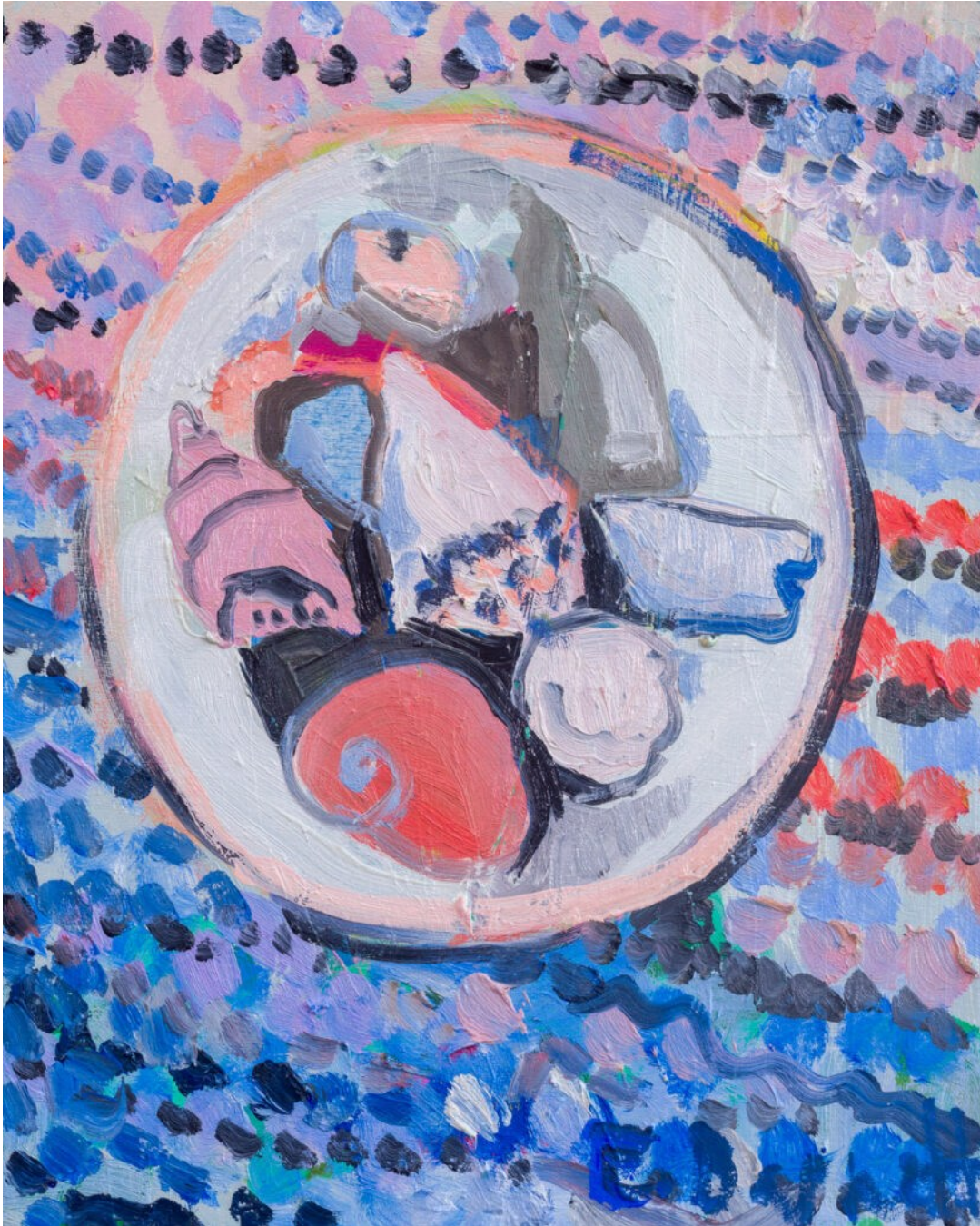
Bowl of Shells