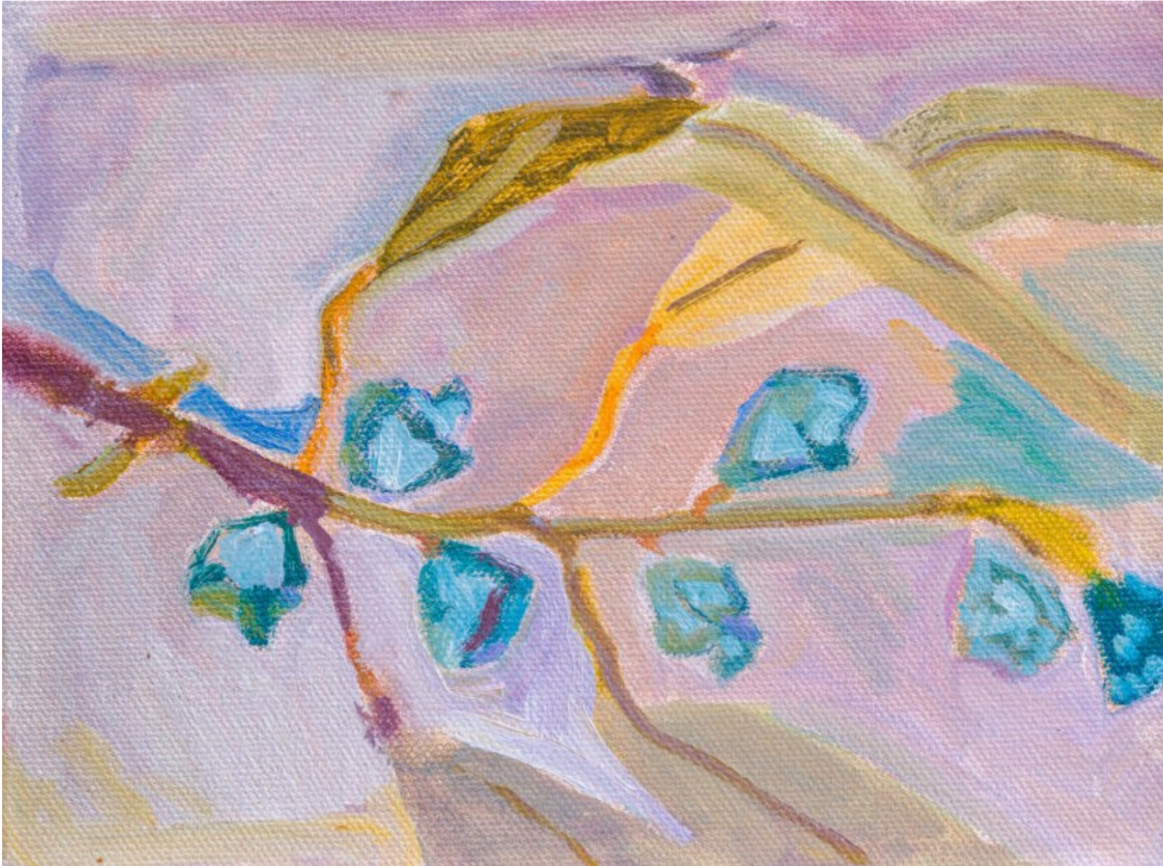
Gum Leaves, Spring Beach