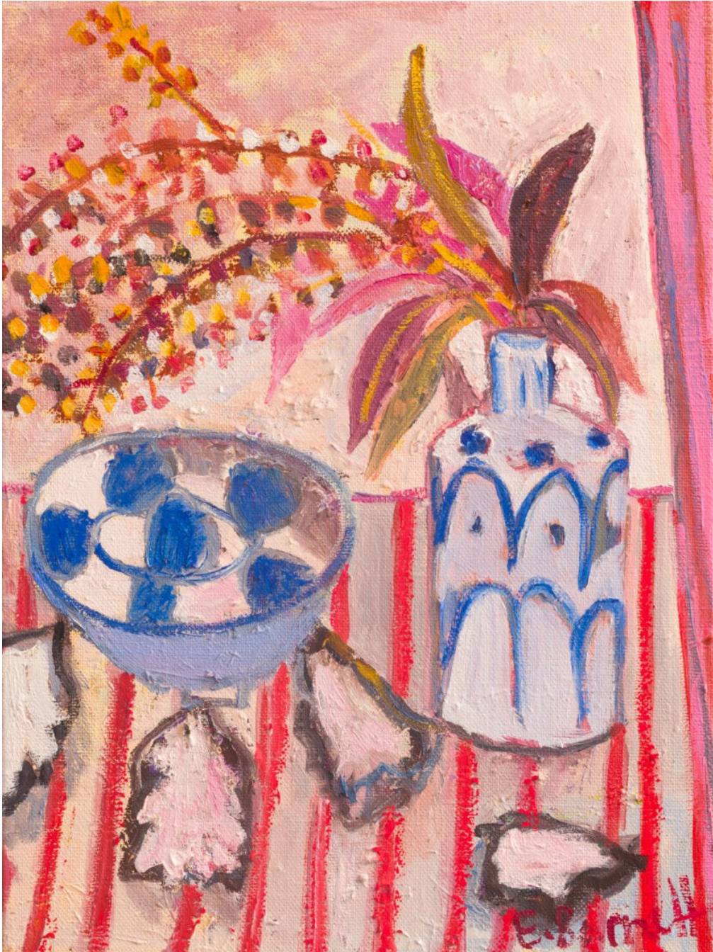
Kitchen Table at Spring Beach