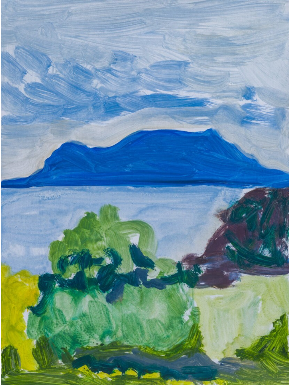
Maria Island From Spring Beach