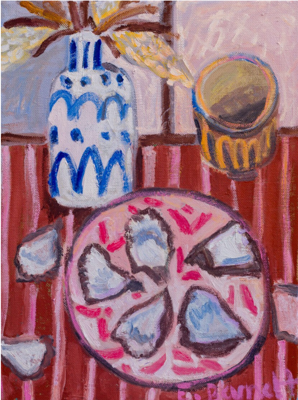
Oysters and Proteas