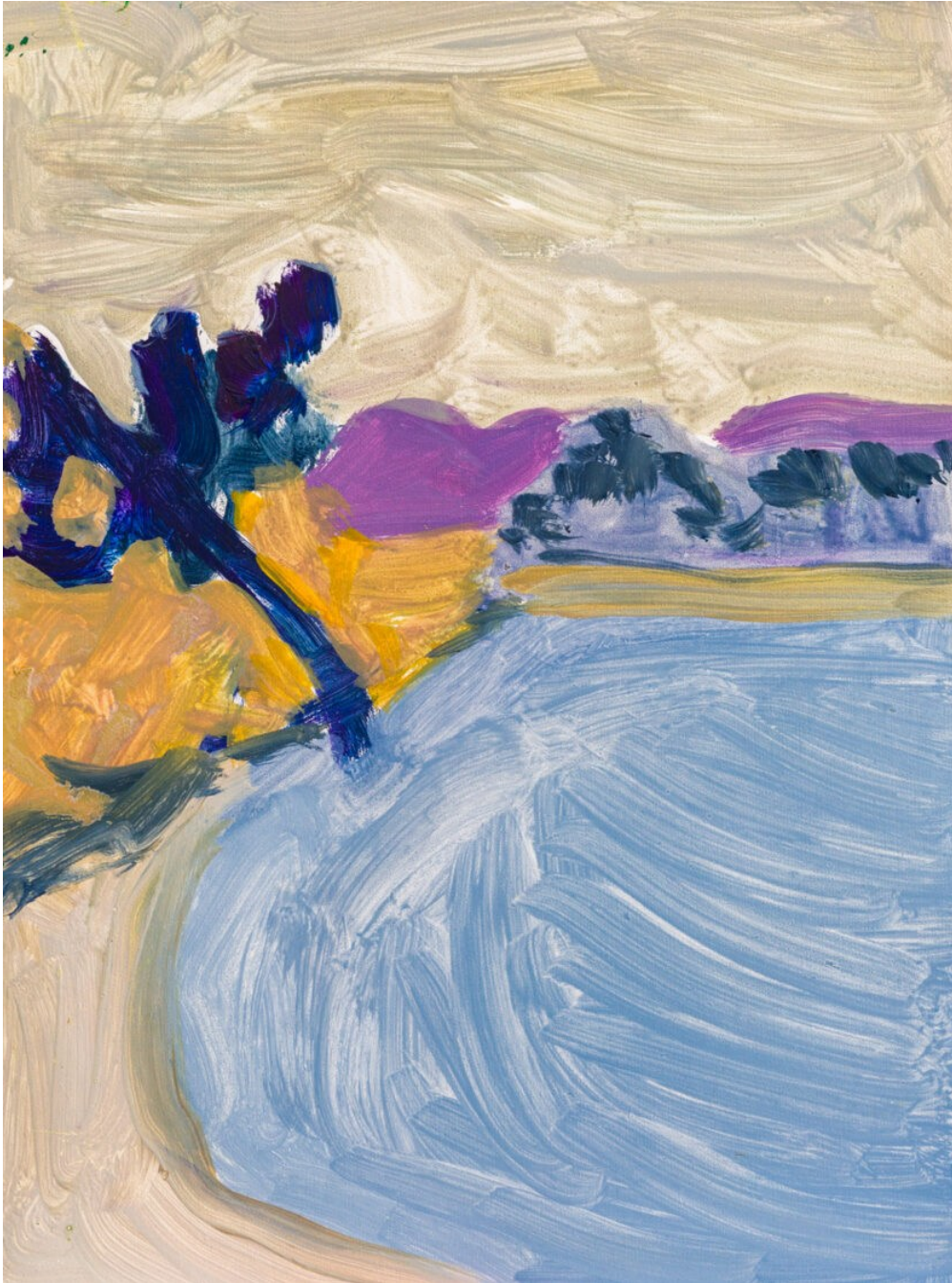
Spring Beach at Dusk