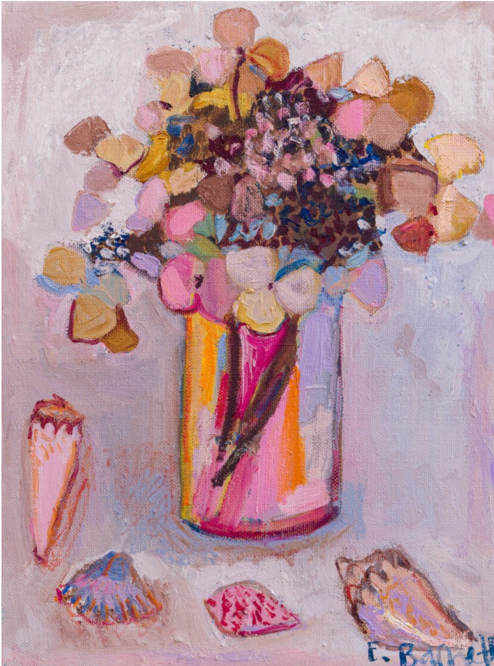
Shell Collector and Hydrangea