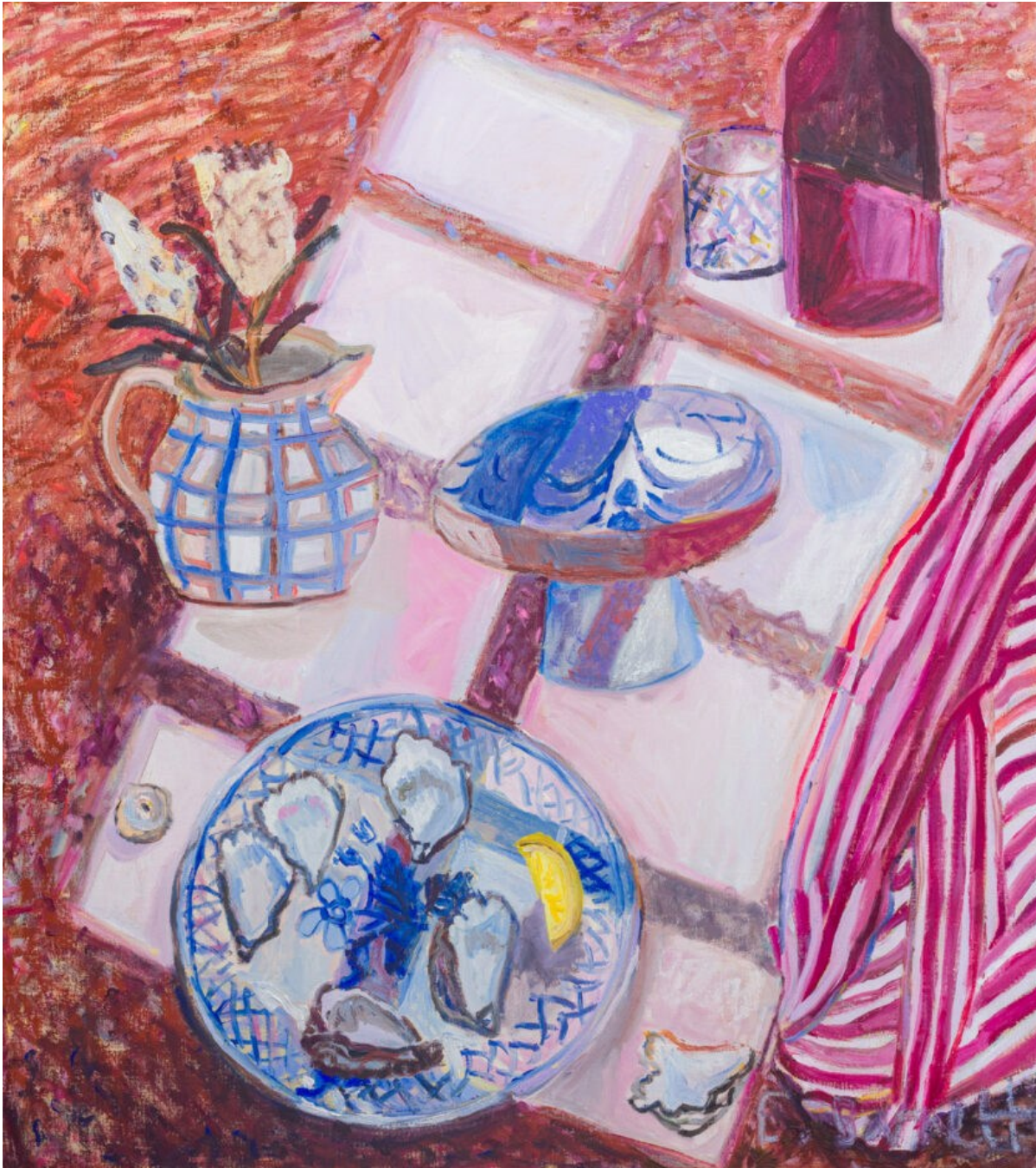
Gift From the Sea