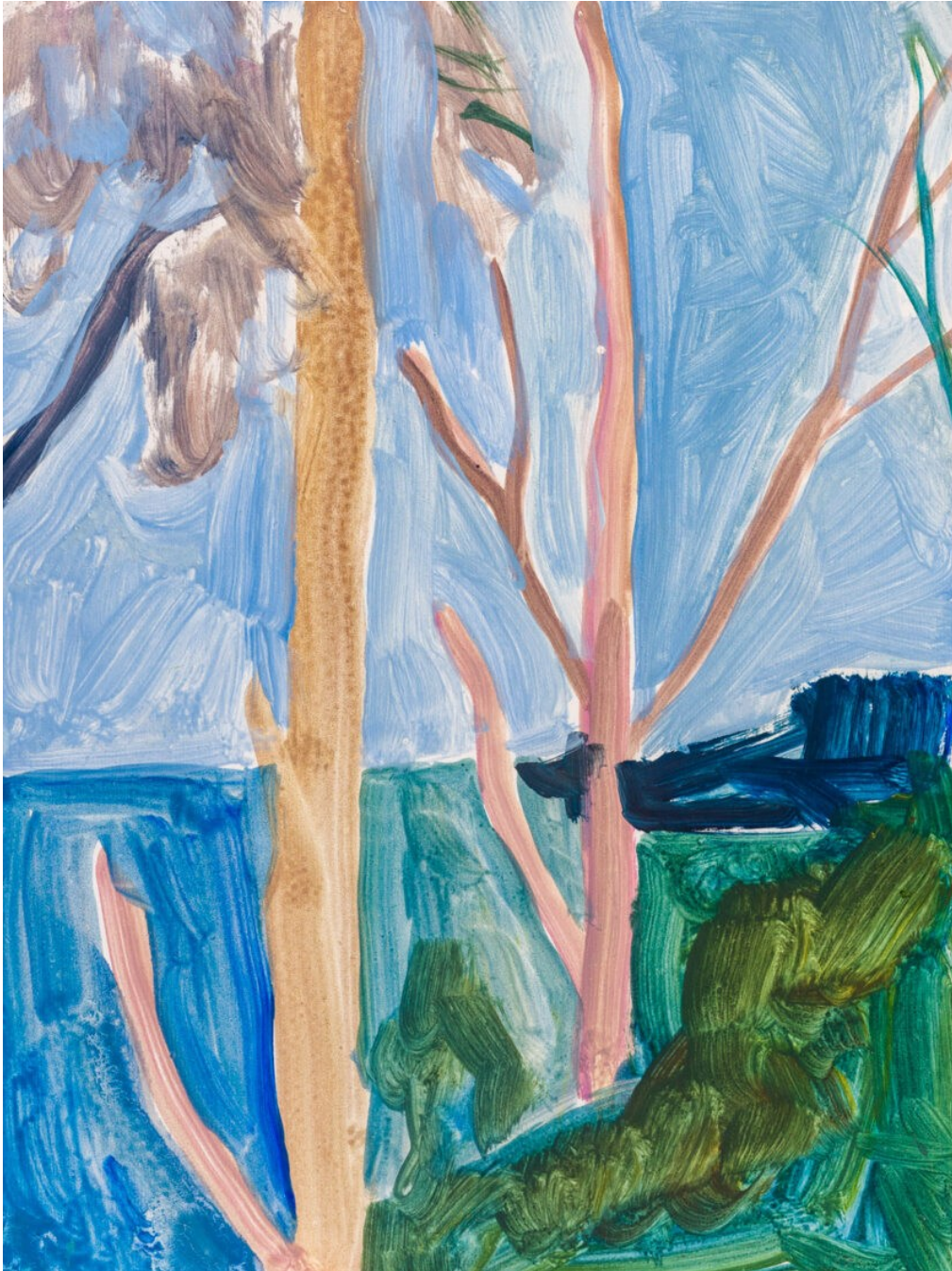
Looking from the Point at Spring Beach