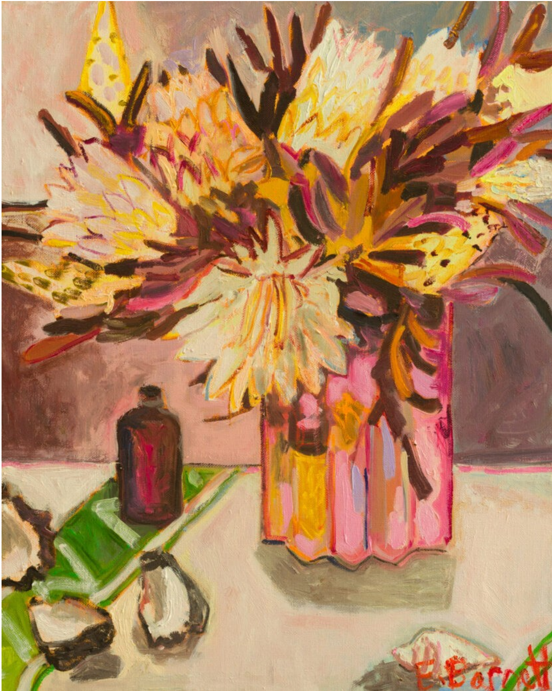
Oysters and Proteas III