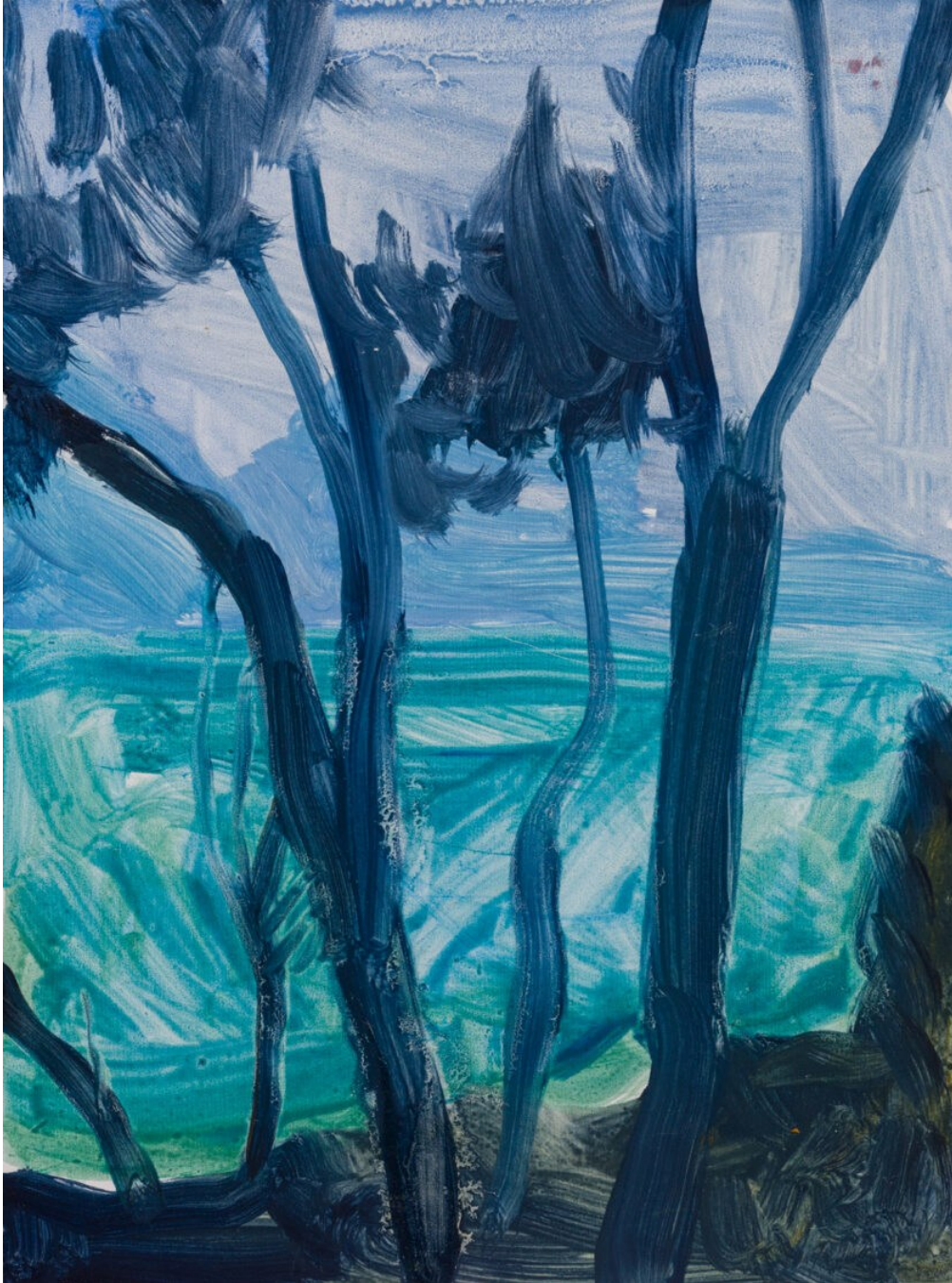
Trees at Spring Beach