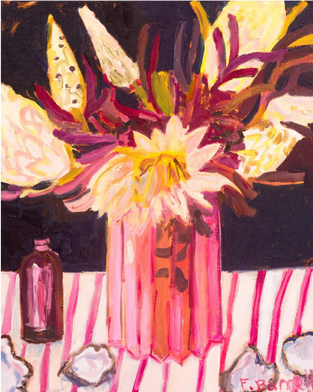
Oysters and Proteas IV