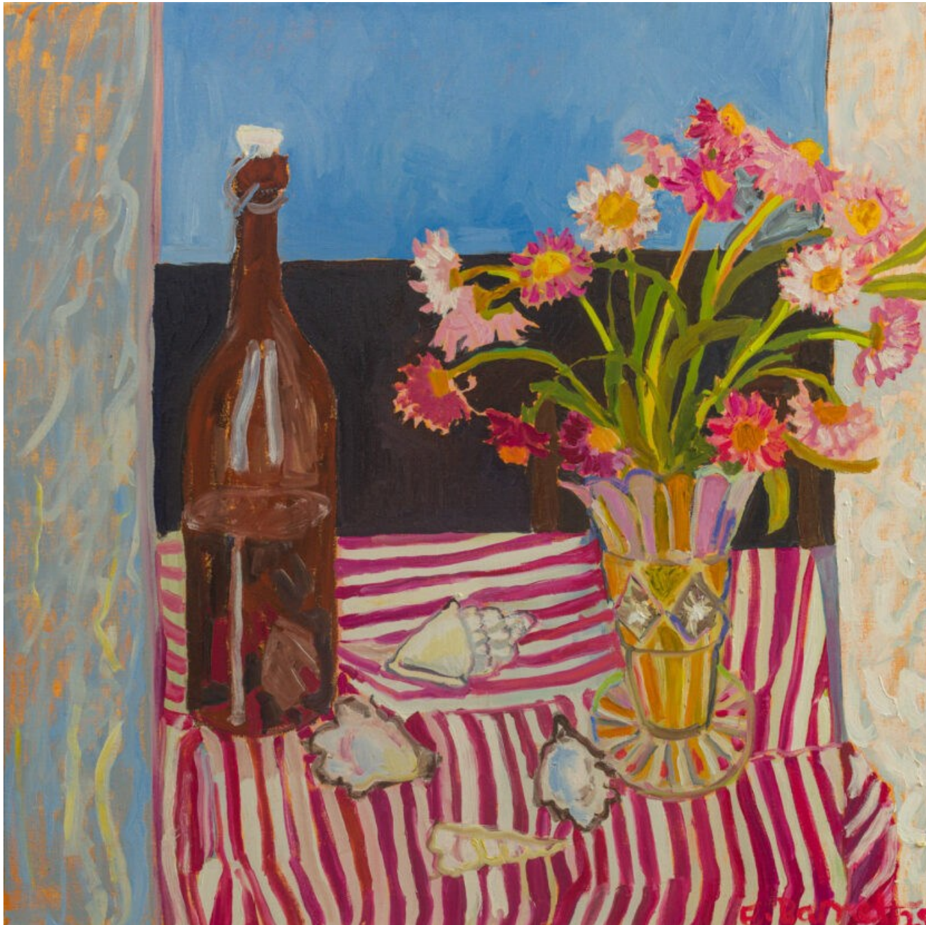
Oysters, Kombucha and Paper Daisies