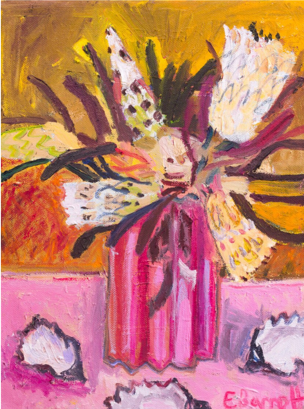
Oysters and Proteas II