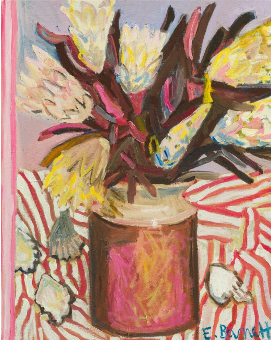
Oysters and Proteas V