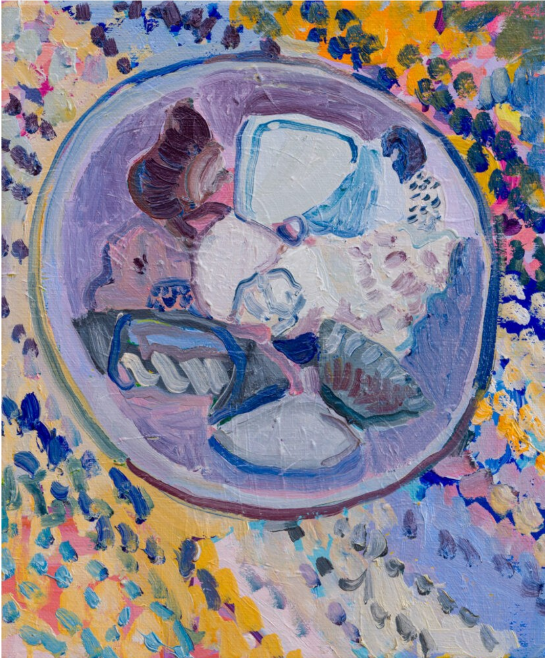
Bowl of Shells II