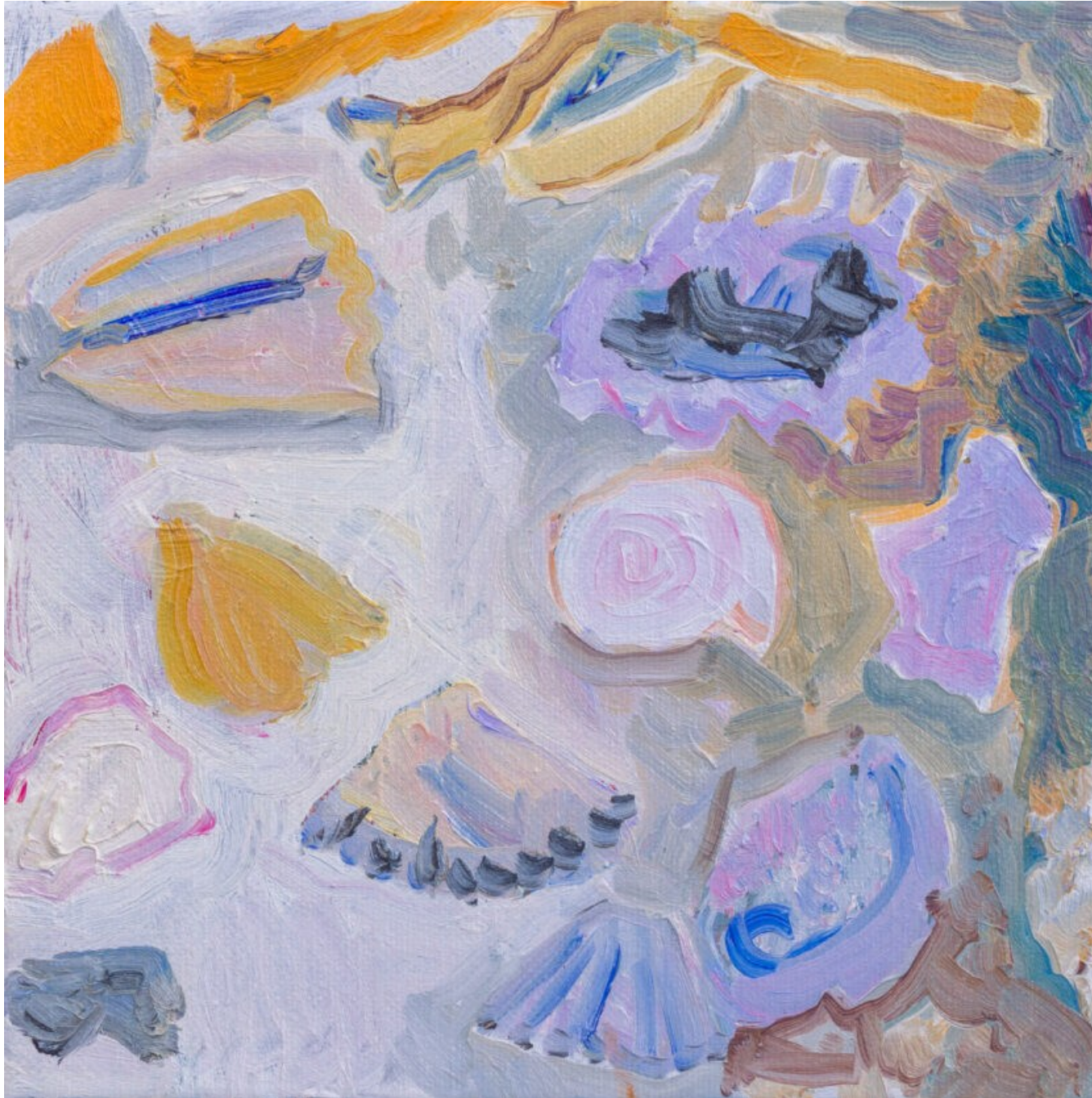
Shell Study Spring Beach