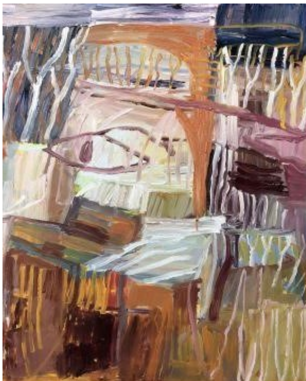
Walking Through The Land