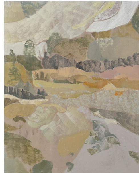
The Stillness of an Autumn Landscape