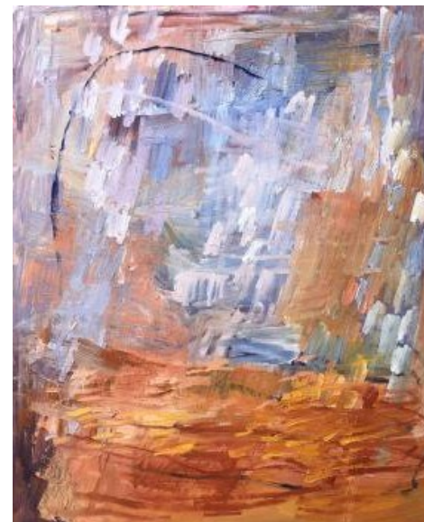
Forest Fire 40 x 45 cm Oil on Board $1500