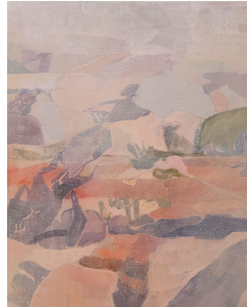
Movements of Autumn