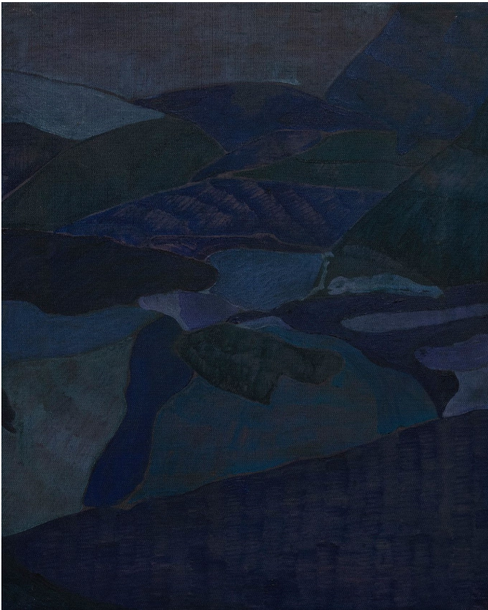
The Woods are Silent