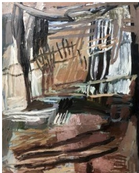
Ghost Gums and Dirt Roads 40 x 45 cm Oil on Board $1500