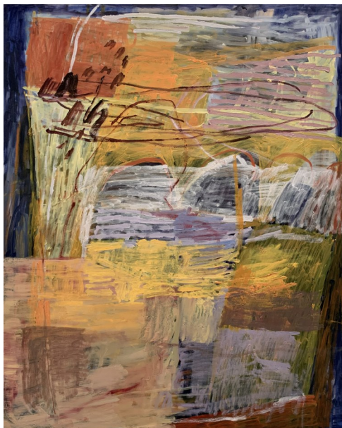
The Beach 61 x 76 cm Oil on Board $1995