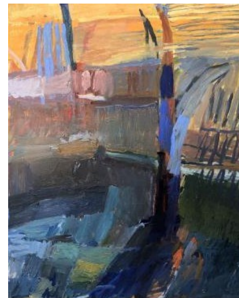
Trees at Night 40 x 45 cm Oil on Board $1500