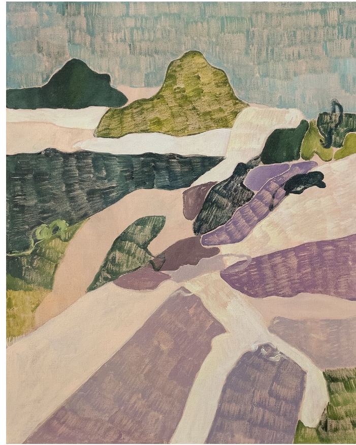
The Wind in the Grass