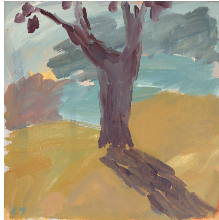
Front and Centre