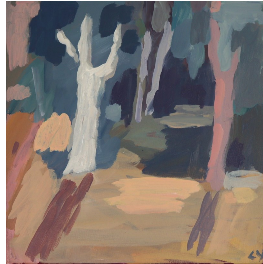
Bush Lines 50 x 50 cm Acrylic on Canvas $990