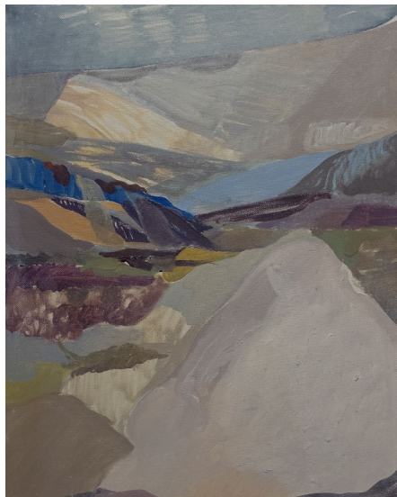
Caught in Time