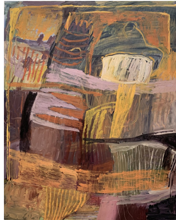
Forest Conflict 61 x 76 cm Oil on Board $1995