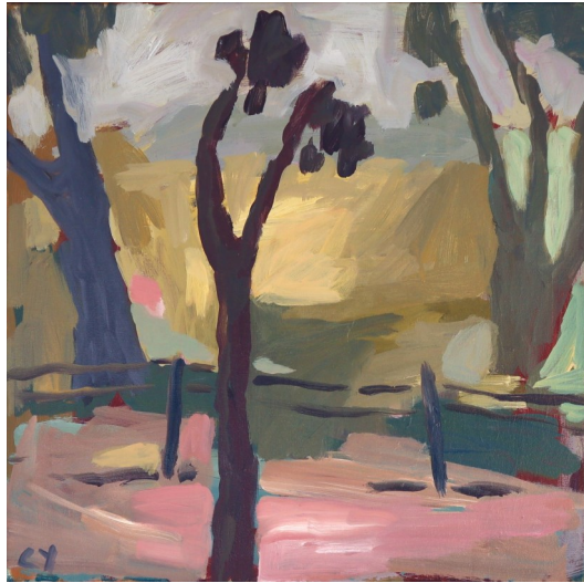
Fenced Off 50 x 50 cm Acrylic on Canvas $990