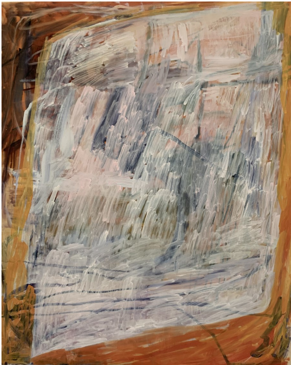
The Void 61 x 76 cm Oil on Board $1995