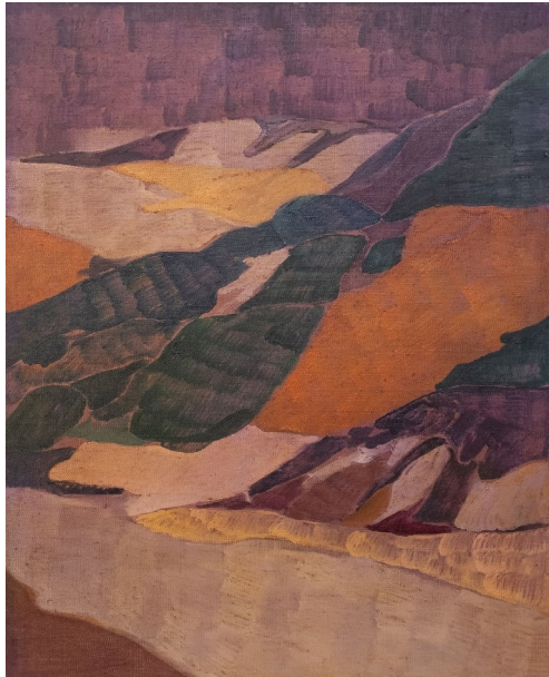
The Purple Sky